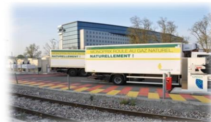
Consolidation centre Project in rail/waterway terminal