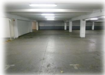
Final delivery point Project in carpark