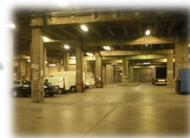
Consolidation centre - Project in underground rail terminal