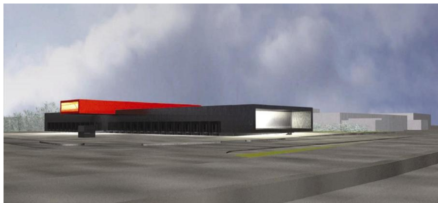
Creteil transit facility 5 000 sq. m. dedicated to parcel delivery