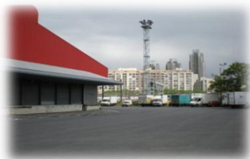
Consolidation centre Project in rail/waterway terminal