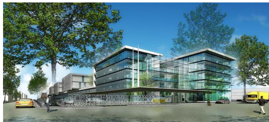
Brussels logistics hotel 50 000 sq. m. dedicated to urban logistics