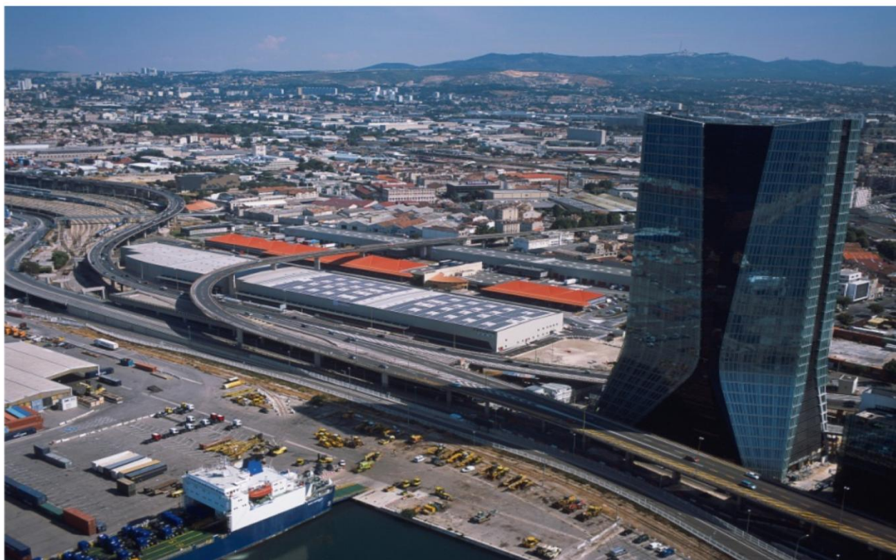
Sea and rail urban freight terminal