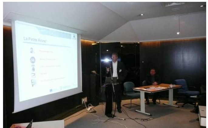
Good practice round table presentation