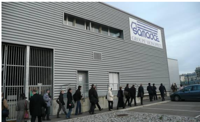
Site visit to Monoprix urban rail freight terminal

Two roundtables were organised. The speakers at the first round table presented their views about the insertion of logistics facilities into an urban environment. Moreover, a site visit to two company logistics platforms (Monoprix and Chronopost) was also held.