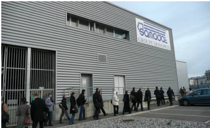
Site visit to Monoprix urban rail freight terminal

Two roundtables were organised. The speakers at the first round table presented their views about the insertion of logistics facilities into an urban environment. Moreover, a site visit to two company logistics platforms (Monoprix and Chronopost) was also held.