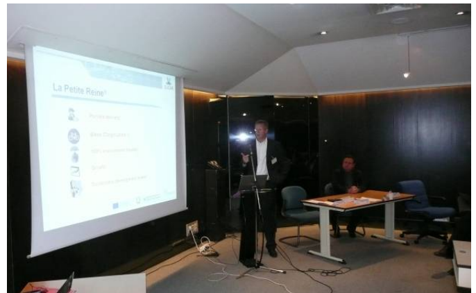
Good practice round table presentation