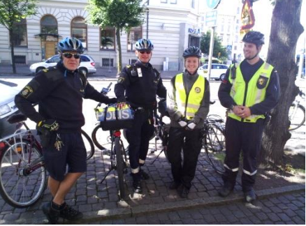
Operational collaboration unit for local traffic regulations (Done)

Made possible by the INTERREG IVC programme